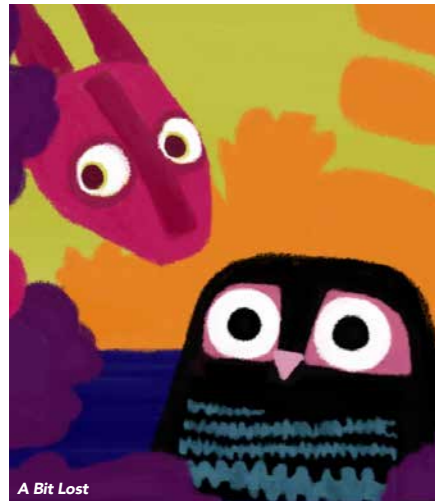
A Bit Lost

Sat 25 August 10:30 - 11:45 Phoenix Screen 2 Free