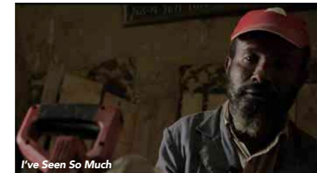
I've Seen So Much