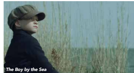
The Boy by the Sea